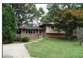
FAIRFAX 4422 SAN CARLOS DR, FAIRFAX, VA 22030 $360,000 3 bed, 4 bath