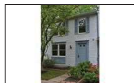
RESTON 11747 MOSSY CREEK LN, RESTON, VA 20191 $380,000 3 bed, 2 bath