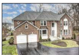
FAIRFAX 13144 ASHVALE DR, FAIRFAX, VA 22033 $785,000 4 bed, 3 bath