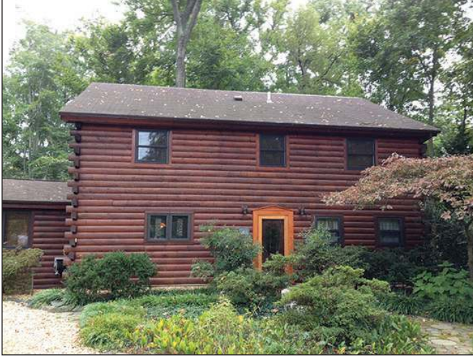
BEFORE: The Thorntons had been pursuing their respective hobbies – woodworking and glass fusion – in a windowless loft above the garage that offered zero natural light.