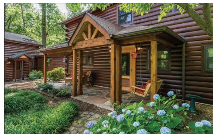
Rough-hewn timbers - the handiwork of Foster master carpenter Mike Borman - are integral to the aesthetics of a new front elevation that is both warmly inviting and whimsical. Red cedar trim and molding provides sympathetic color accents.