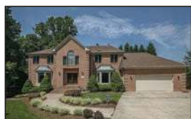
MCLEAN 1401 INGEBORG CT, MCLEAN, VA 22101 $1,310,000 7 bed, 5 bath