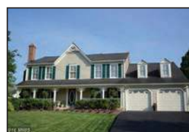
CENTREVILLE 6324 DRILL FIELD CT, CENTREVILLE, VA 20121 $675,000 4 bed, 4 bath