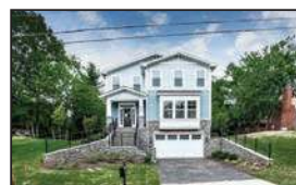
VIENNA 604 JOHN MARSHALL DR NW, VIENNA, VA 22180 $1,150,000 6 bed, 5 bath