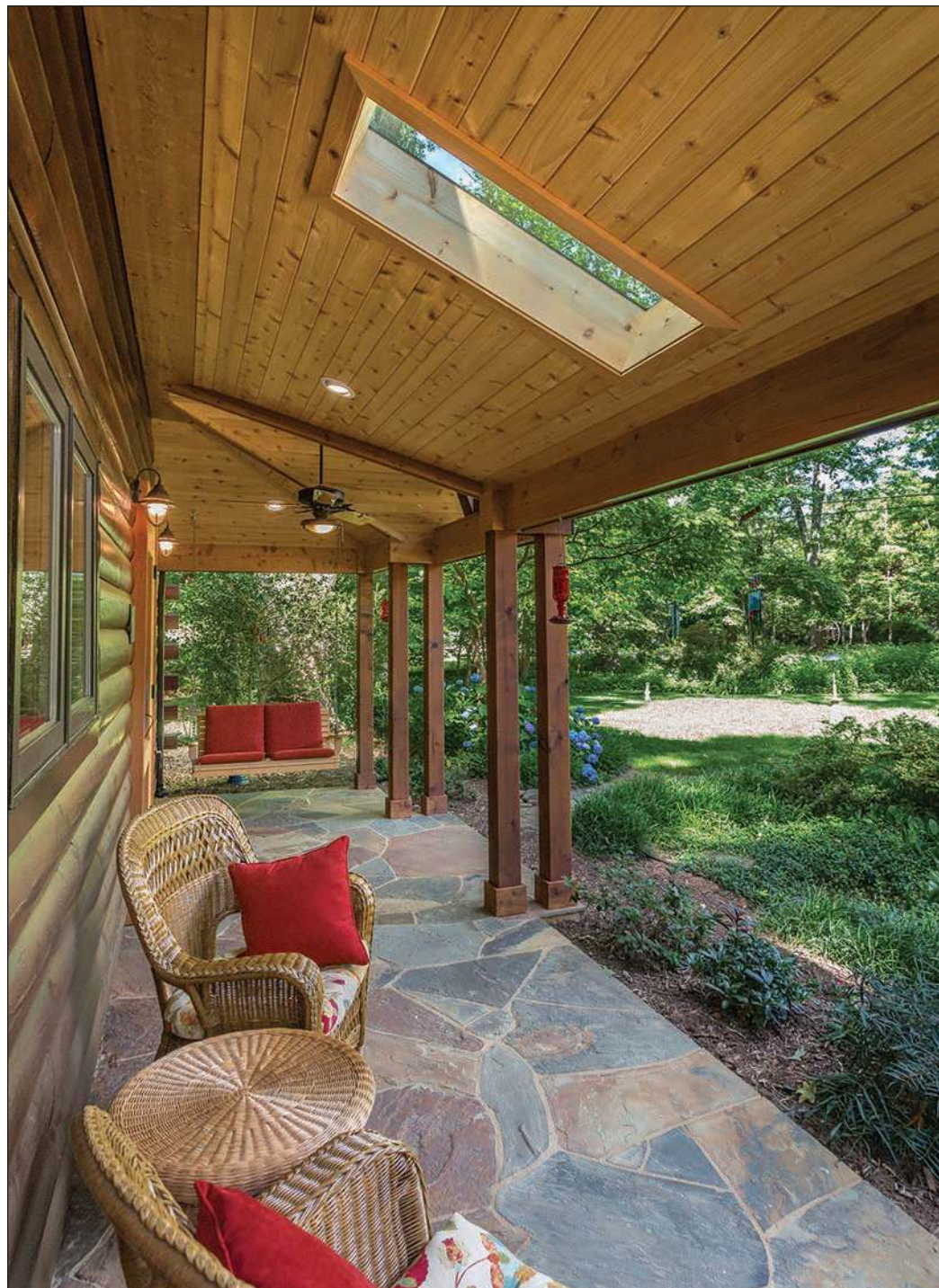
Underfoot, a 25-by-7 flagstone patio lends setting-appropriate color and texture. The 21-by-46-inch Velux skylight allows needed available light.