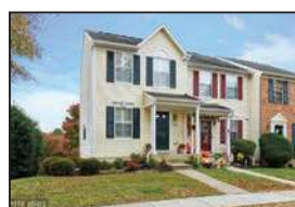
CENTREVILLE 6881 CHASEWOOD CIR, CENTREVILLE, VA 20121 $309,900 2 bed, 2 bath