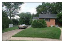
MCLEAN 6612 DENNY PL, MCLEAN, VA 22101 $775,000 4 bed, 3 bath