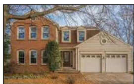
VIENNA 203 EAST ST NE, VIENNA, VA 22180 $781,500 3 bed, 2 bath