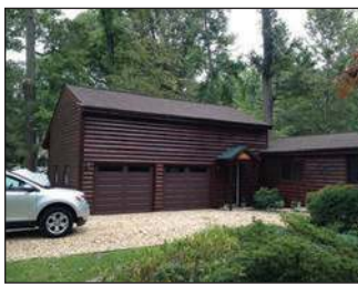
BEFORE: Despite the lack of headroom, the Thorntons diligently practiced their chosen crafts in the space above the garage for 14 years.

Summarizing the well-planned lifestyle shift, Kirby says the couple is frequently in the studio at the same time. A window in the interior partition allows each spouse to witness the other's progress - if so inclined. It's a working environment, but also a place of