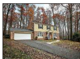
RESTON 2425 BRAMBLEBUSH CT, RESTON, VA 20191 $690,000 5 bed, 3 bath