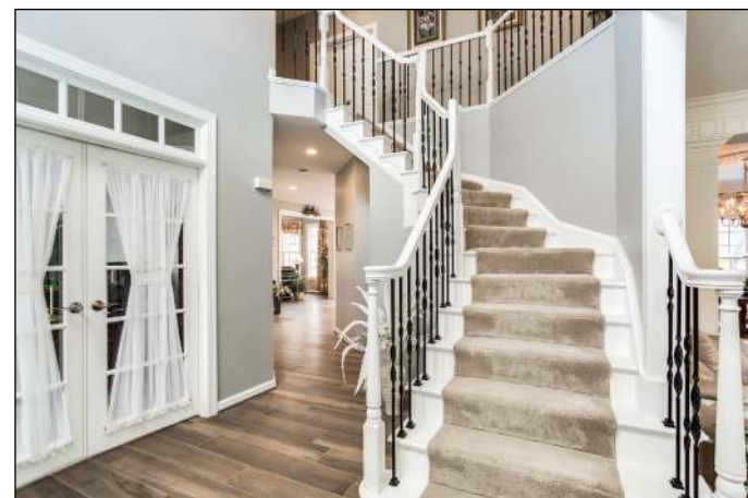
AFTER: Owners Kevin and Priscilla Kelleher wanted a transitional-style interior emphasizing contrasting lights and darks. The wooden staircase spindles were replaced with black wrought iron elements; staircase treads and risers were painted white.