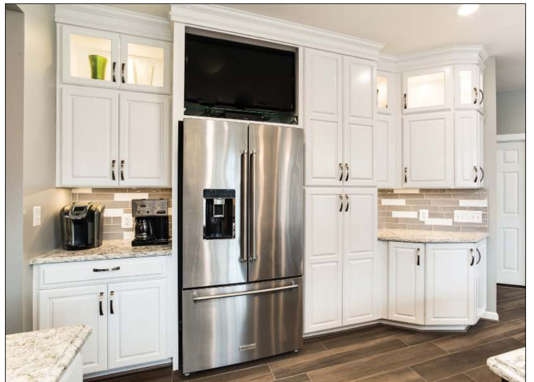
Clemens created an eye-catching visual rhythm by combining gray (genesi) and white (bianco) quintessenza mosaic backsplashes with more traditional raised-panel cabinet facings. The backlit glass-facing cabinets were designed to display collectibles.