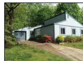
RESTON 12201 NUTMEG LN, RESTON, VA 20191 $359,950 3 bed, 2 bath