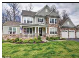
MCLEAN 1302 SCOTTS RUN RD, MCLEAN, VA 22102 $1,786,000 7 bed, 6 bath