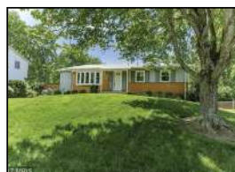
VIENNA 8317 COTTAGE ST, VIENNA, VA 22180 $588,750 4 bed, 2 bath