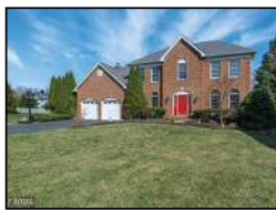
RESTON 10864 HUNTER GATE WAY, RESTON, VA 20194 $873,000 5 bed, 3 bath