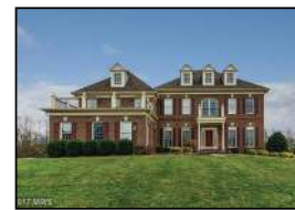
CENTREVILLE 5133 PLEASANT FOREST DR, CENTREVILLE, VA 20120 $975,000 5 bed, 5 bath