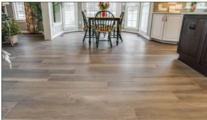
Foster Remodeling Solutions has become a leading local resource for porcelain flooring with a wood grain finish. The wood pattern is ink-jetted into the tile, which offers the warmth of the traditional look with much greater durability.