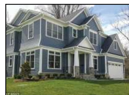
VIENNA 924 HILLCREST DR SW, VIENNA, VA 22180. $1,420,000 5 bed, 5 bath