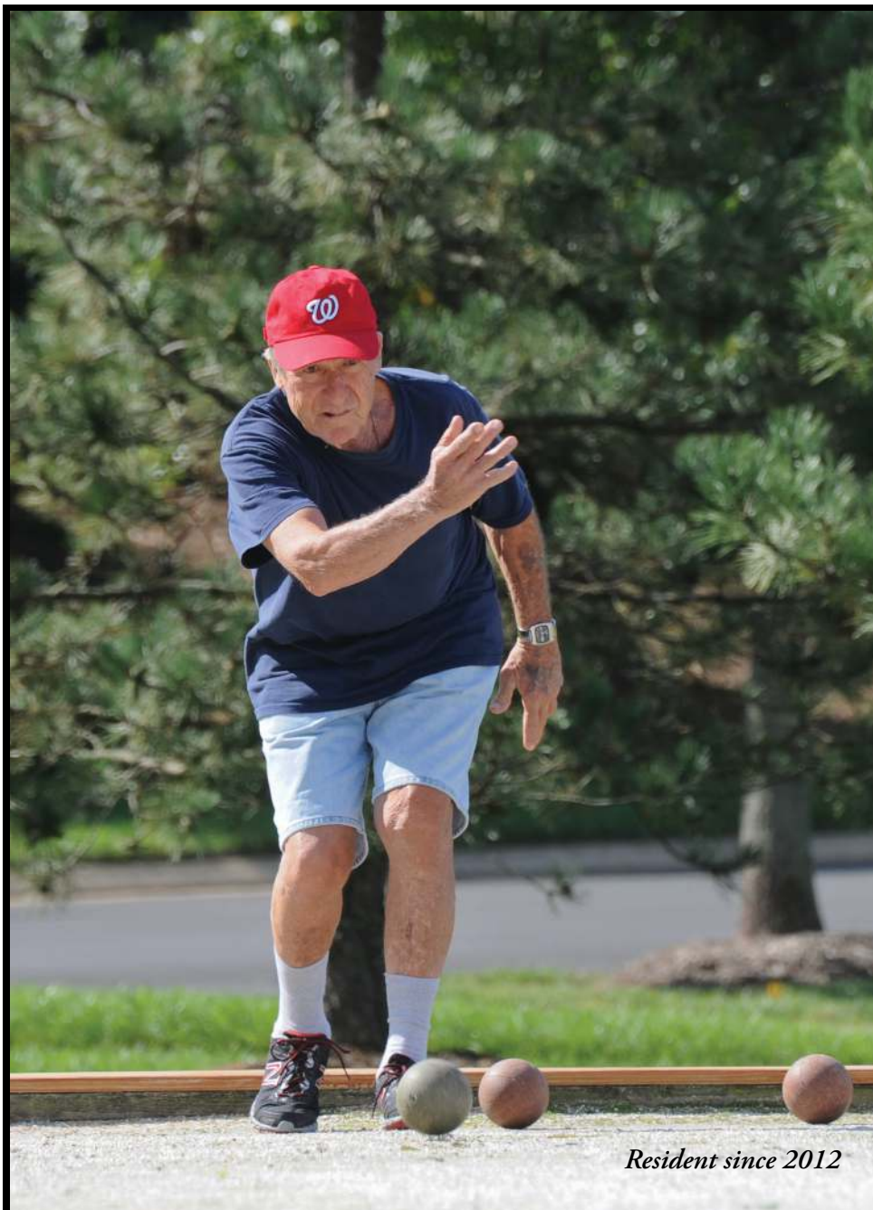
Resident since 2012