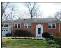
MCLEAN 7001 SOUTHRIDGE DR, MCLEAN, VA 22101 $822,500 4 bed, 3 bath