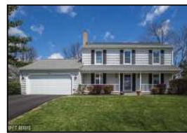
CENTREVILLE 13920 CRISTO CT, CENTREVILLE, VA 20120 $520,000 3 bed, 3 bath