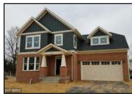
FAIRFAX 4629 CAPRINO CT, FAIRFAX, VA 22032 $951,155 5 bed, 4 bath