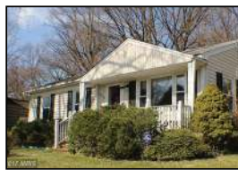
FAIRFAX 10832 WOODHAVEN DR E, FAIRFAX, VA 22030 $395,000 3 bed, 1 bath