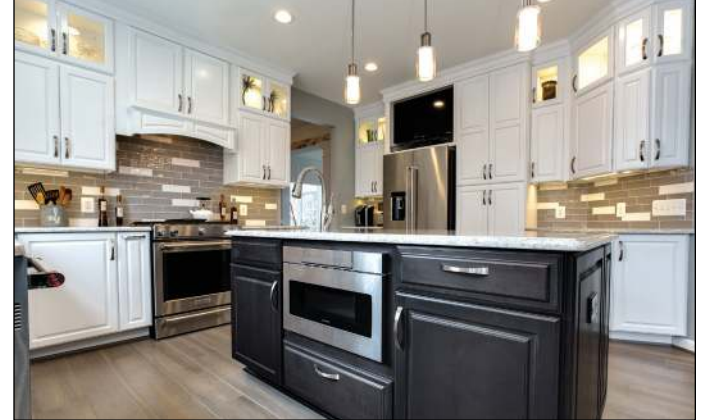
The 5'9"-by-36" food prep island includes a microwave drawer and custom-designed storage compartments. Kitchen surfaces are Cambria Berwin quartz finished with an OGE edge.