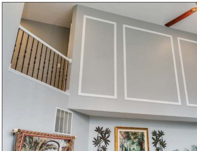
AFTER: Clemens designed a picture frame molding to add depth and visual drama to the home's formerly non-descript foyer.